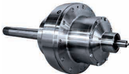
ZSP – Cyclo/Planet Line

ZSPN external drive with customer-specific output for trailing scrolls