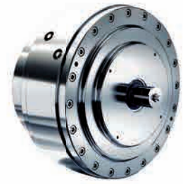
ZS – Cyclo Line

The compact and high-capacity centrifuge drive in a flange design and all-steel construction.