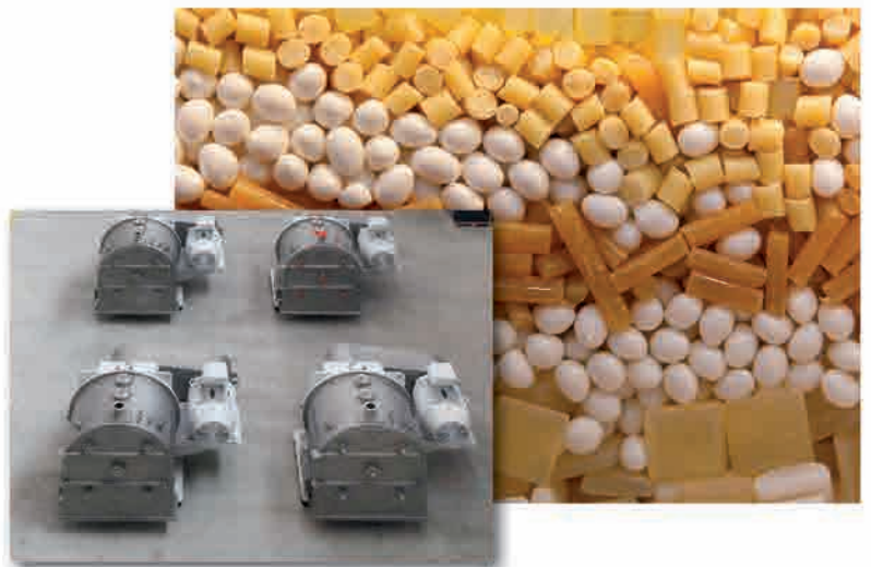
Screen scroll centrifuges for plastic granule extraction