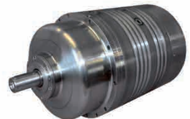
ZP – Planet Line

* ZPN input and output shafts with the same rotation direction