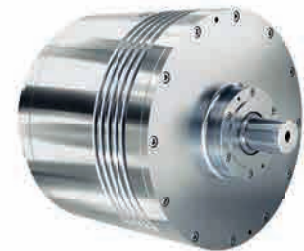
ZP – Planet Line

The highly dynamic centrifuge drive for high drum and differential speeds with a proven flange design and all-steel construction.