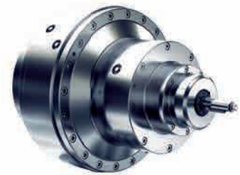
ZSP – Cyclo/Planet Line

The two-stage, high-capacity centrifuge drive for high reduction ratios and differential speeds with a proven flange design and all-steel construction.