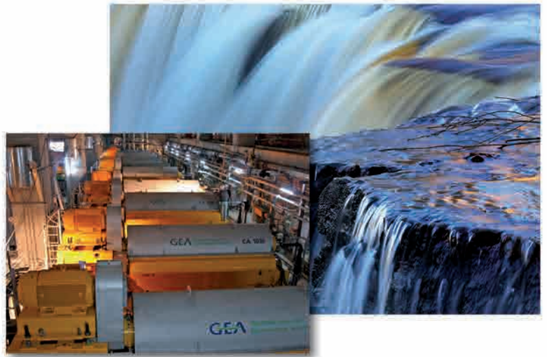
Decanter for sludge dewatering