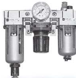
Polycarbonate Bowl with Bowl Guard, Manual Drain; optional Metal Bowl w/ auto drain.