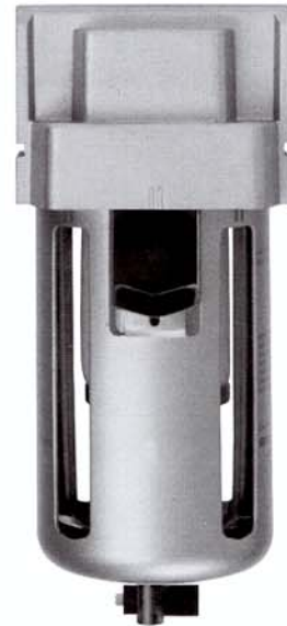
Polycarbonate Bowl with Bowl Guard, Manual Drain; optional Metal Bowl w/ auto drain.