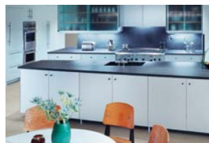
The FT DigitalRadio is especially suitable for installation in the kitchen and dining room.