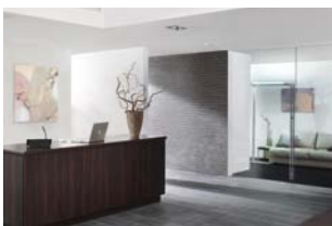
Helps to coordinate: Busch-AudioWorld® in a legal practice.