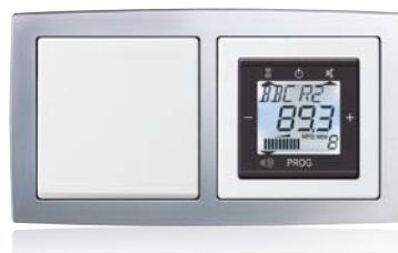
2gang combination Switch/intercom amplifier