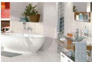
Music in the bathroom too. This is provided by an amplifier insert and the installation of speaker modules.