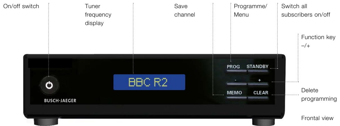
Central unit with integrated stereo radio tuner