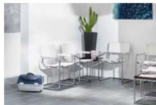
For the best connections to the waiting room: the amplifier with intercom function.