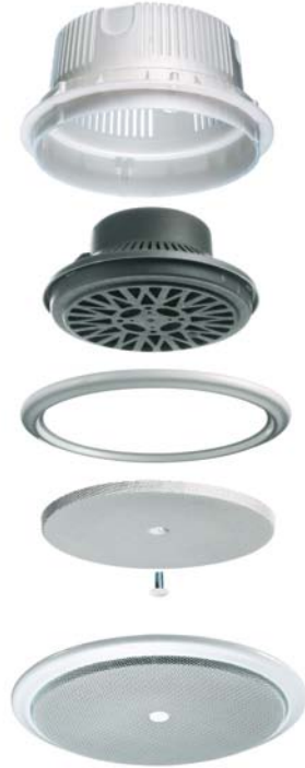
Built-in 5" (12,7 cm) speaker for dry locations