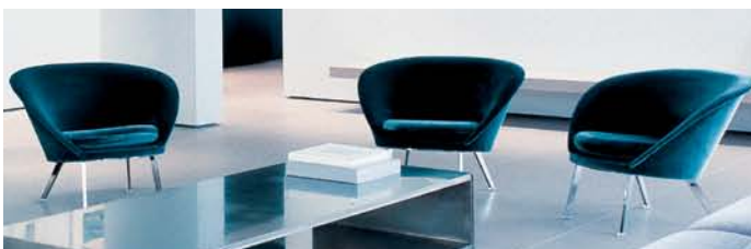
The intercom function for calling patients from the waiting room.

amplifier insert is switched on, it automatically switches off the music in this room. The deactivation time can be set in 5 minute steps between 5 and 60 minutes. There are two different versions of amplifier insert – with and without a broadcasting function. The broadcasting variant offers the possibility of using the system as an intercom system, e.g. in doctors' surgeries or legal practices. It is equipped with a broadcasting function including volume control. If you do not wish to be disturbed, press the „Do not disturb“ button to prevent announcements from coming through. The entire system can be combined with various Busch-Jaeger switch ranges.