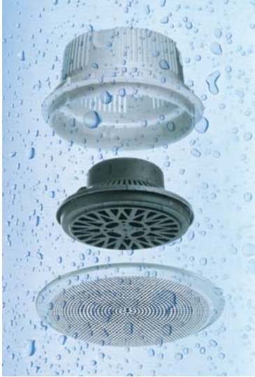
Built-in 5" (12,7 cm) speaker for damp locations