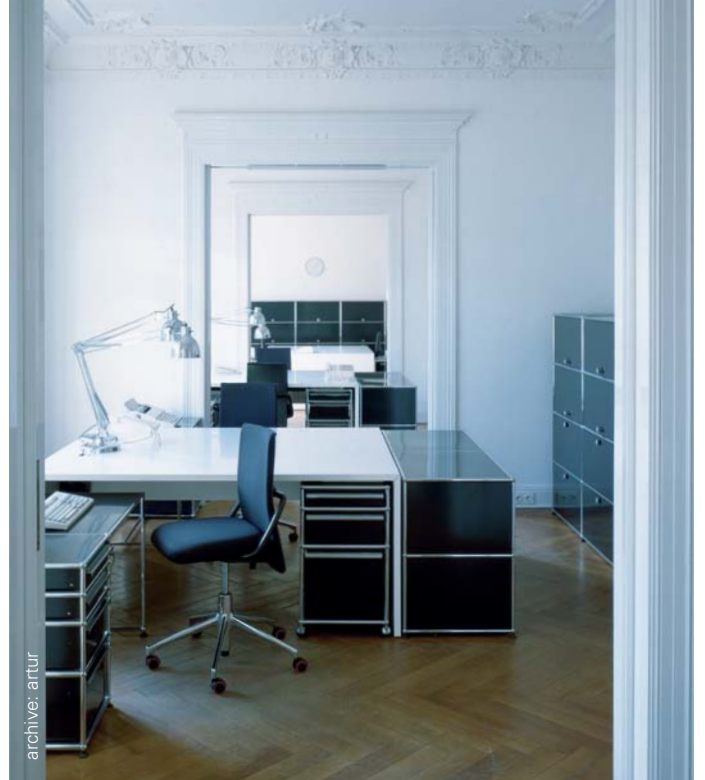
In offices with suspended ceilings, the built-in 5" speakers can be used.